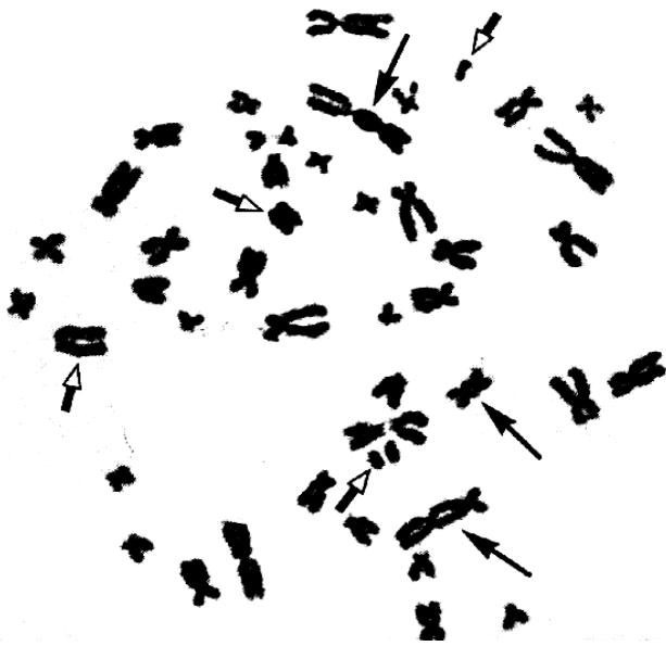
Fig.1 Dicentric chromosomes (black arrows) in a human metaphase and associated acentric fragments after high dose exposure (from Fritz-Niggli 1997)

We refer also to results of the studies about reciprocal translocations in lymphocytes (visualized by FISH) which are used to estimate the accumulated dose because these aberrations are also stable. The background rate is, however, highly variable and accumulating with age, therefore the sensitivity is not always sufficient to evaluate exposures by environmental radioactivity.